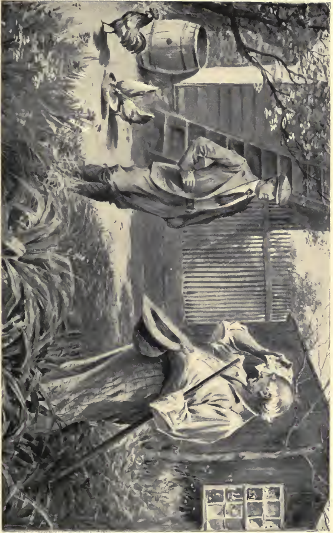
“HE LIFTED HIS TATTERED STRAW HAT.”